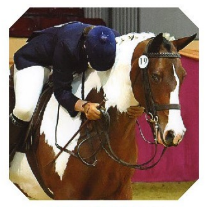
TAKING THE BISCUIT AGED 23

29<sup>th</sup> September - 1<sup>st</sup> October 2023 Over 150 classes and £1,000 prize money | Arena UK | Lincolnshire