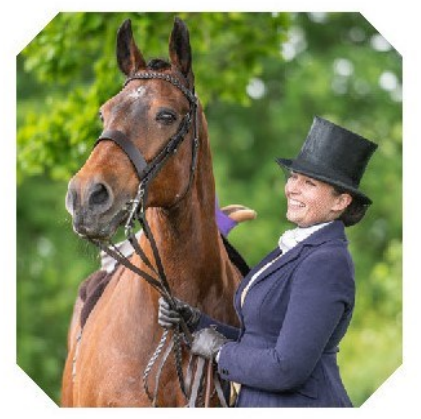
KNAVESGREEN HONEY PIPPIN AGED 26