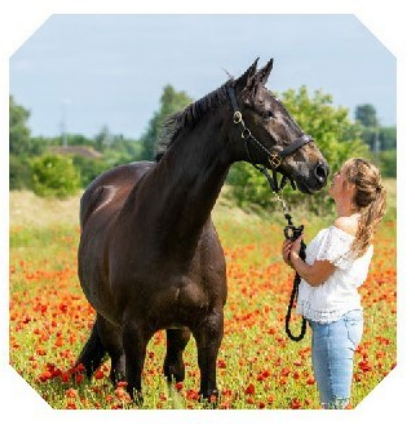
MAYSONG AGED 25