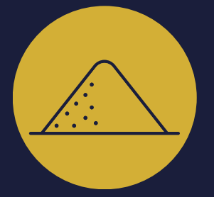
Choose your horses supplements